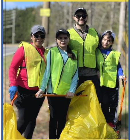
The Hovis Family