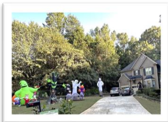
OCTOBER 2023 1040 Grove Park Lane