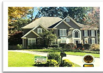
NOVEMBER 2023 1325 Grove Park Lane