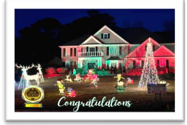
DECEMBER 2023 1205 Grove Park Lane